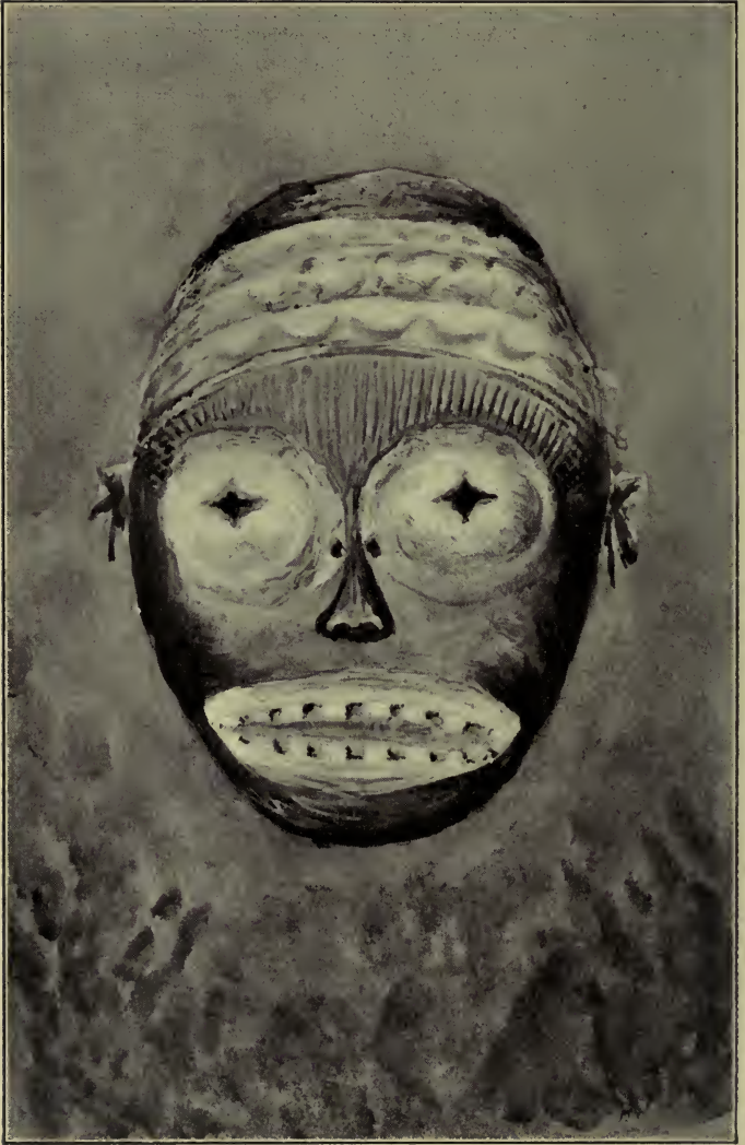
JU-JU MASK FROM IBO COUNTRY, SOUTHERN NIGERIA